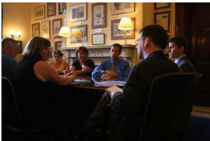
Meeting with staff of Senators Kerry and Kennedy