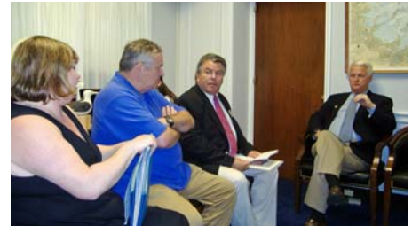
Meeting with Congressman Delahunt

The discussions included concerns about FCC orders which impose new rules on licensing; efforts to enact legislation which would allow for federal and/or state