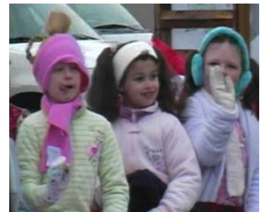
Girl Scouts - Brownie Troup